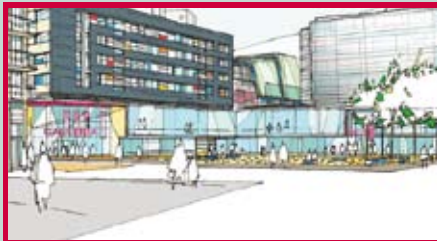
Liljeholmsborg Stockholm - Sweden Mixed use, 20,000 sqm