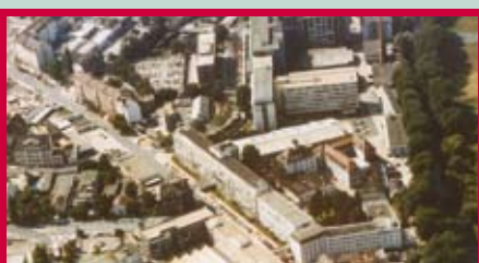
Uferstadt Nuremberg - Germany Office, 71,000 sqm