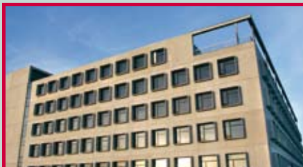
Kobenhavns Energi (Sjælsø Gruppen JV) Copenhagen - Denmark Office, 16,500 sqm