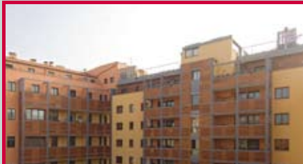
Orti Antichi Milan - Italy Residential, 27,500 sqm