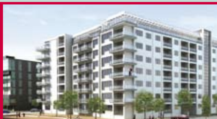
Havnestad Syd (Sjælsø Gruppen JV) Copenhagen - Denmark Office/Residential, 67,000 sqm