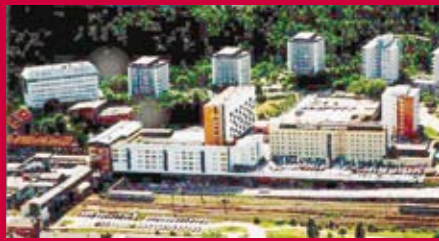
Tumba Centrum Stockholm - Sweden Retail/Residential/Office, 32,000 sqm