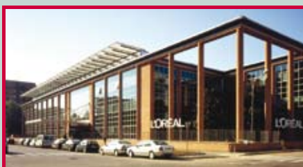
L'Oréal Italia Headquarters Milan - Italy Office Redevelopment, 20,000 sqm