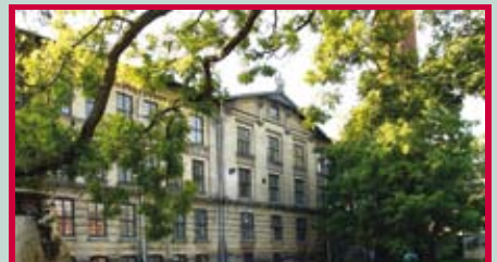
Royal Scandinavia (Sjælsø Gruppen JV) Copenhagen - Denmark Office/Residential, 72,000 sqm