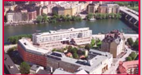
Liljeholmsstrand Stockholm - Sweden, Office 38,000 sqm