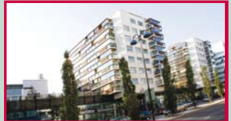
Finnish Retail Portfolio 8 Assets in Finland Retail/Ancillary Office, 137,000 sqm