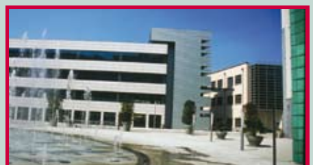
Bodio Center Milan - Italy Office Redevelopment, 65,000 sqm