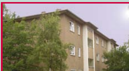
Berlin Residential Portfolio Berlin - Germany Residential, 62,700 sqm