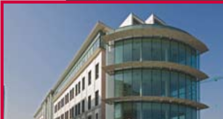
Maciachini Center Milan - Italy Office, 67,000 sqm