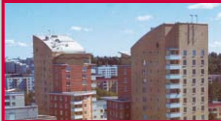
Jakobsberg Centrum Stockholm - Sweden Residential, 67,000 sqm