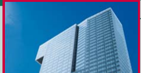
IZD Tower Vienna - Austria Office, 63,000 sq m